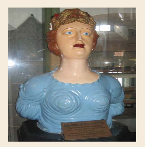
"Hamadryad bowsprit, Pembroke Museum"